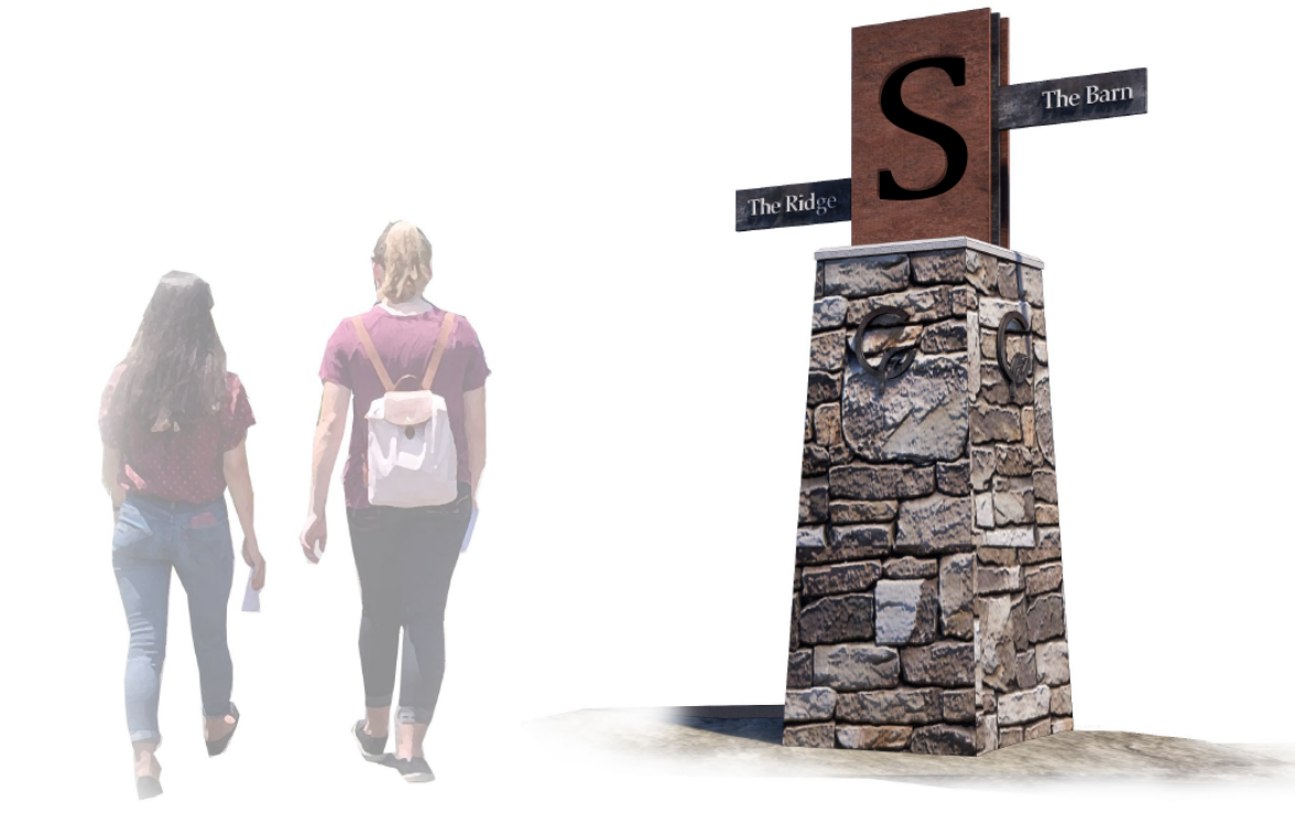
WAYFINDING SIGNAGE EXAMPLE