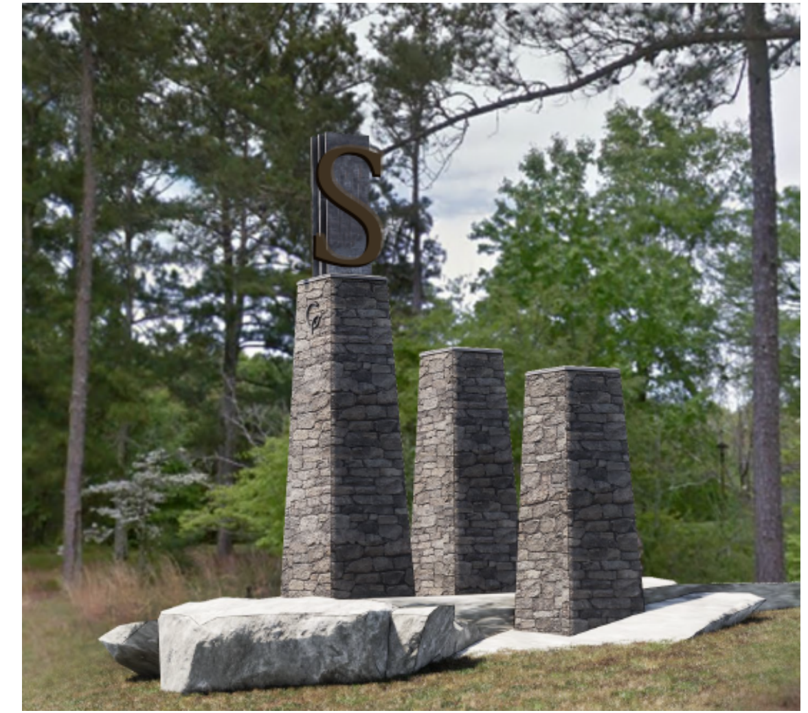
MAIN ENTRANCE SIGNAGE EXAMPLE