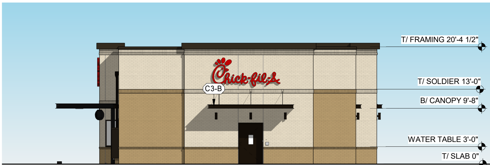
EXTERIOR ELEVATION 1" = 10'-0"