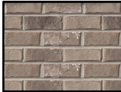
BR-1: BRICK VENEER - HENRY BRICK - "CHIMNEY ROCK"