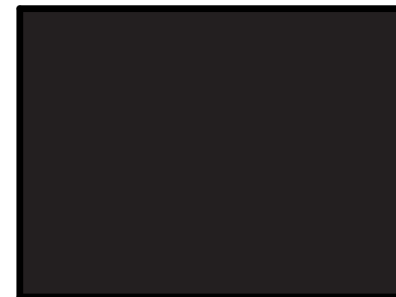
AW-2: METAL STANDING SEAM AWNING - COLOR TO MATCH PAC-CLAD "MATTE BLACK"