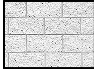
MV-1: MASONRY VENEER - INTEGRALLY COLORED SPLITFACE CMU - ADAMS PRODUCT - 4301