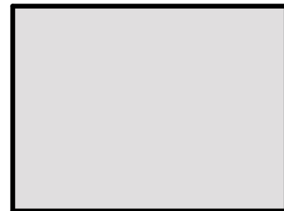
SF-1: ALUMINUM STOREFRONT - CLEAR ANODIZED ALUMINUM